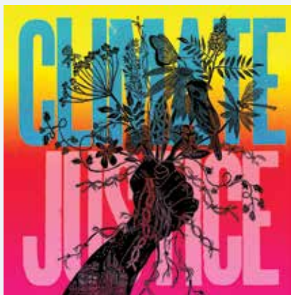
ART BY KIVA STIMAC

Equitable measures save lives and health care costs, prevent ineffective public policies and better prepare all people in Canada for the future, together.