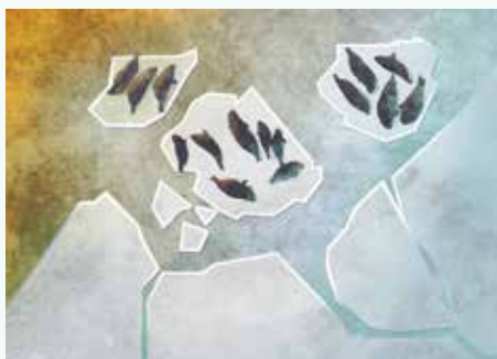
ART BY CRYSTAL SMITH