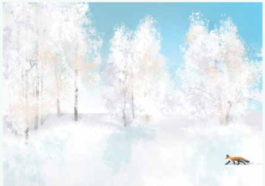
ILLUSTRATION: CRYSTAL SMITH