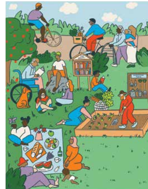
ART: LINNY MALIN

The world’s current dominant economic system is built on an endless “make, use, dispose, repeat” cycle, extraction industries and worker exploitation. It perpetuates overconsumption, waste and environmental injustice and isn’t working for people or the planet.